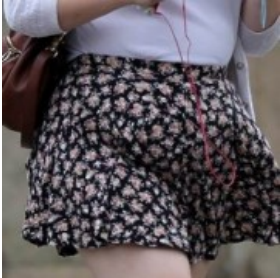
The Sad But Real Truth About Heavier Women