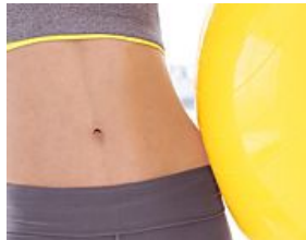
Prevention Shrink Your Belly In 14 Days