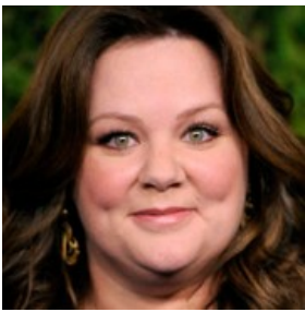
Melissa McCarthy Reveals a New Slimmed-Down Look