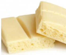
14 Foods You Should Never Eat