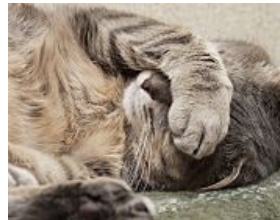
Prevention 5 Daily Habits That Are Draining Your Energy