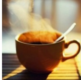
The Simple Thing You Can Do In The Morning To Lose Weight recommended by Zergnet