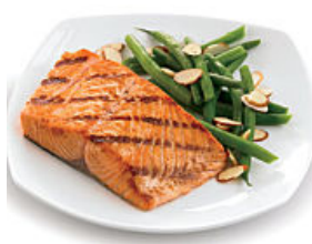
Prevention Flat Belly Diet 1-Week Meal Plan