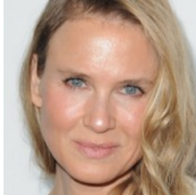
What Exactly Did Renee Zellweger Do to Her Face?