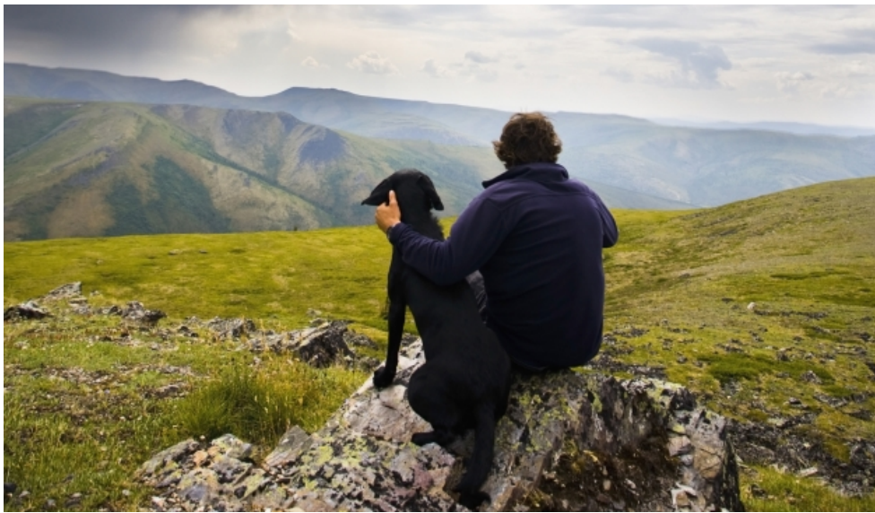
Share the trail with your pal. You'll get shots like this.

Taking your dog hiking lets you experience his pure joy when he connects with his inner wolf. Here's how to protect him during your adventure.