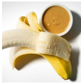
How To Ditch Your Belly For Good