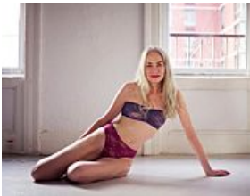
Prevention What Sexy At 60 Looks Like