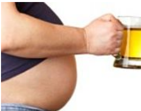
Interesticle 6 Habits That Cause Belly Fat